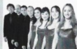
Swingle Singers May 12, 2009

All Concerts 7:30 PM at the Craterian Tickets $25 Adult, $5 Student From the Craterian Box Office Call 541-734-4116 for more information or see our web site www.jcconcerts.org