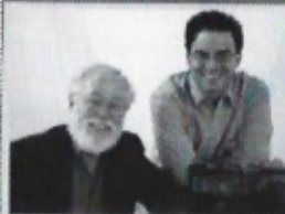
Pianofiddle - Dec. 9, 2008