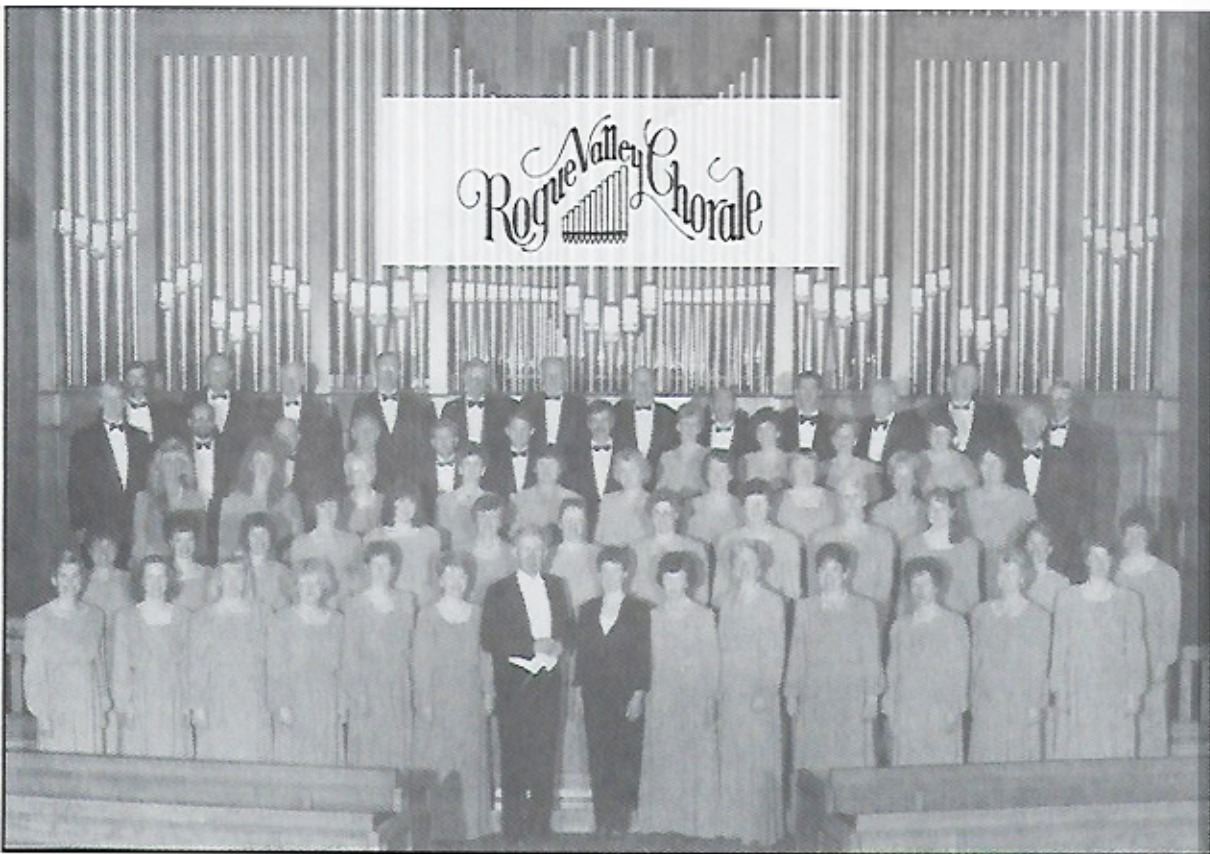
Rogue Valley Chorale