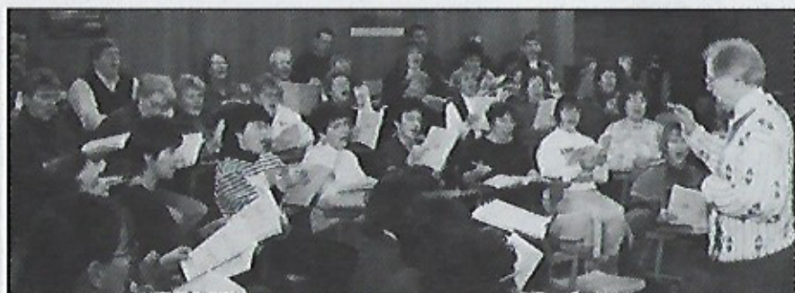
The Rogue Valley Chorale in rehearsal.

hearsal just prior to the performance. Chorale members are expected to attend every rehearsal in order to achieve the blend, balance, and artistry necessary to present outstanding concerts. Members who must be absent are asked to notify their section leader or the Director.