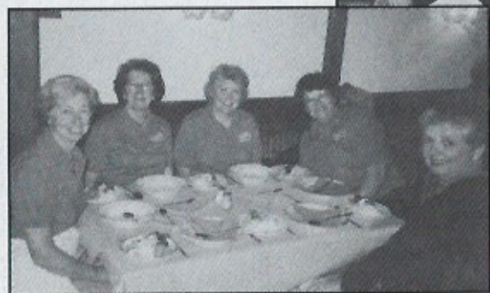
Chorale Members enjoy dinner in an Austrian Restaurant.

Granting institutions have also been supportive of the Chorale program. In its early years the Chorale received annual grants from the Medford Junior Service League. The Chorale also was awarded a $1000 grant by the National Endowment for the Arts for a special performance and it was the recipient of a $500 grant from the Oregon Arts Commission. In 1980 the Carpenter Foundation funded a program for Community Outreach in the Choral Arts. This enabled the group to work with the then newly formed Klamath Symphonic Choir and also to compile a handbook as a guide for other choruses desiring organizational assistance. In 1996 the Chorale received a $2500 matching funds grant from the Carpenter Foundation to assist in funding the presentation of The Passion According to St. John by J.S. Bach. A grant was also received from the Oregon Community Foundation to assist with the production of this masterwork.