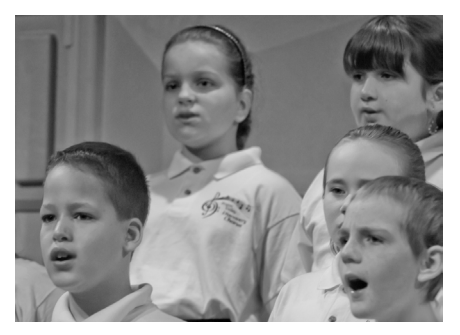
Rogue Valley Youth Choruses Rogue Valley Youth Choruses provide opportunities for talented young singers to participate in choirs of the highest quality.

Our four choruses provide students in grades 3 to 12 with performance experience in local theaters, area schools, at choral festivals and for community groups.