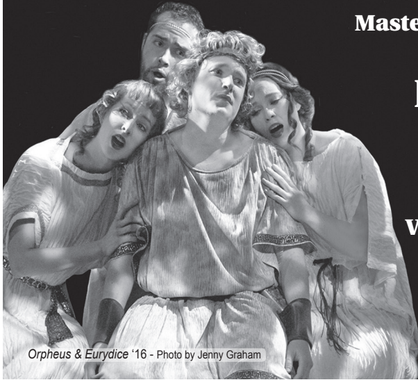
Orpheus & Eurydice '16

and James M. Cellier Young Artist Program