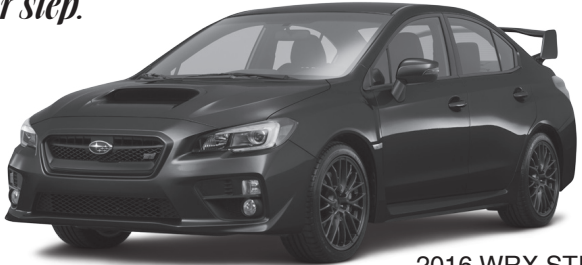
2016 WRX STI

Subaru owners share the special feeling ~ every time they get behind the wheel.